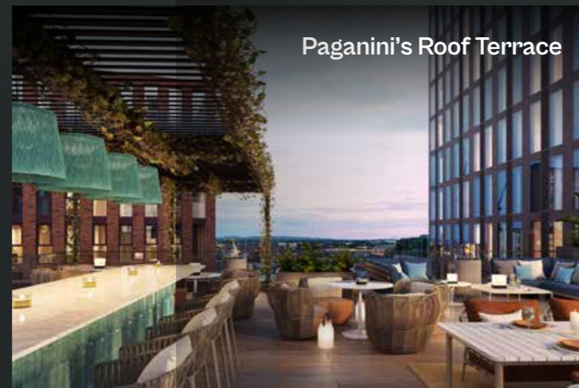
Paganini's Roof Terrace