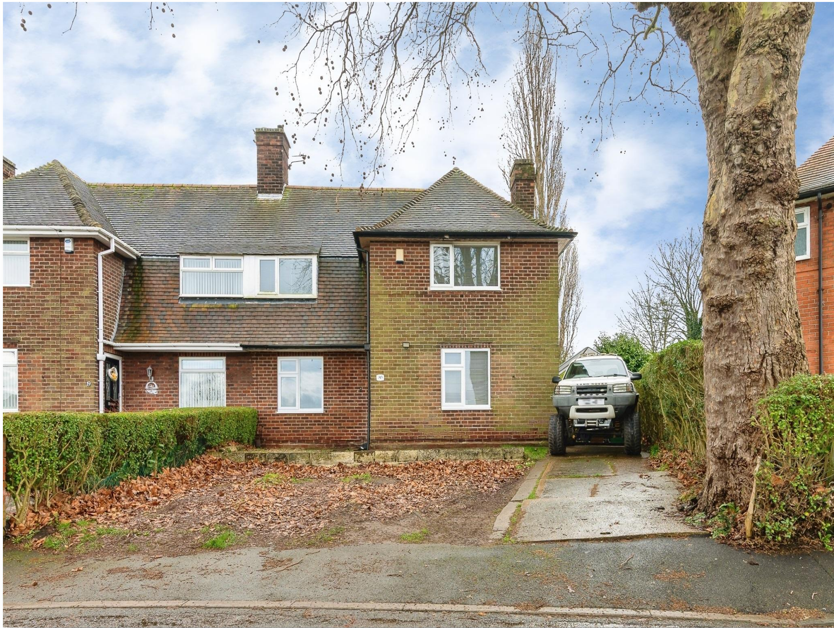
Munford Circus, Nottingham NG8 6ED