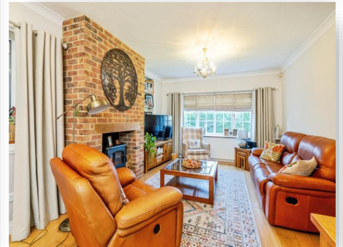
Victoria Drive, Bognor Regis PO21 2TA