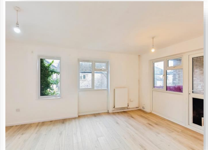
Ripley Walk, Corby NN18 9JR