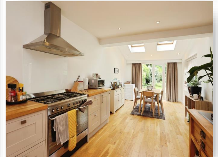
Bleakmoor Close, Rearsby