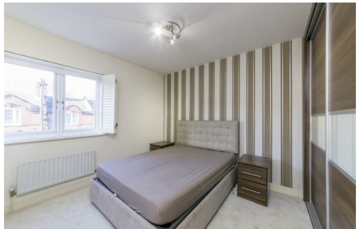
Barge House Road, E16