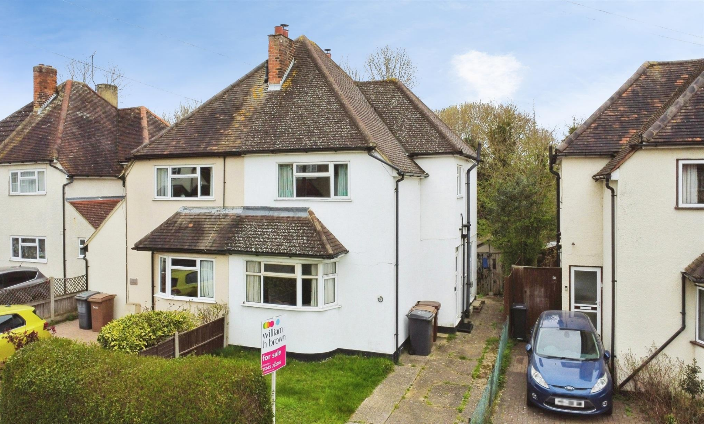
Greenways, Chelmsford CM1 4EF