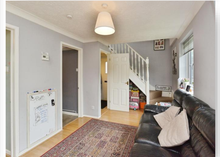
Lynott Close, Crownhill Milton Keynes MK8 0DJ