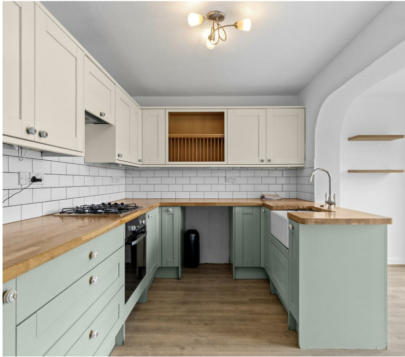
Hayland Green, Hailsham