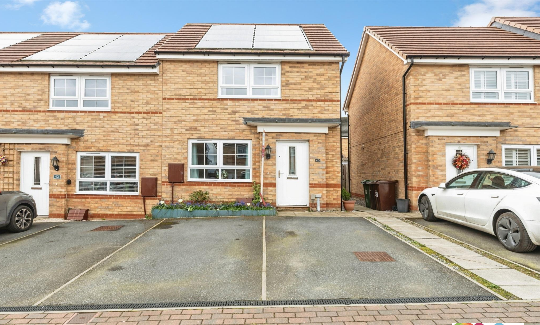
Ramsden Crescent, Pontefract WF8 2FU