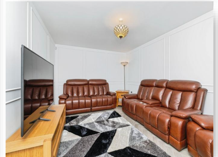
Butterstone Avenue, Hartlepool, TS24 0GA