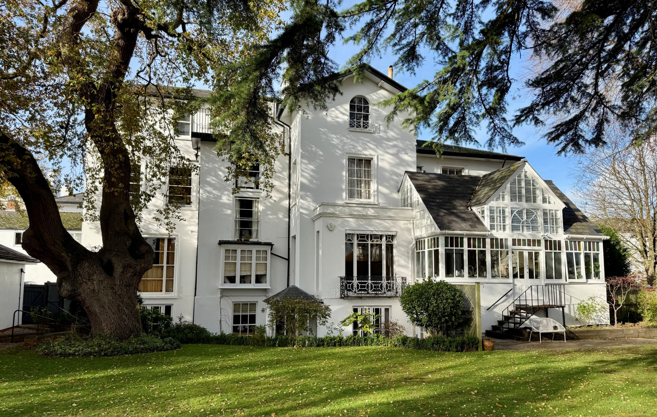
Flat 4 Crofton Lodge, 3 Grafton Road, The Park, Cheltenham Gloucestershire GL50 2ET