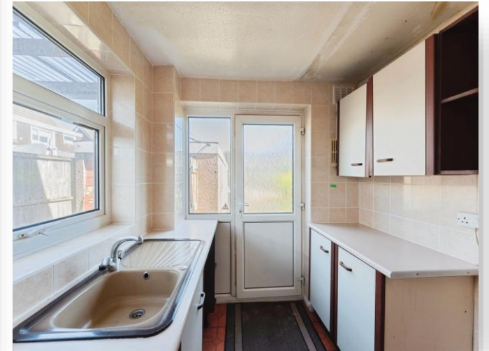
Two Acre Grove, Great Sutton Ellesmere Port CH66 2SD