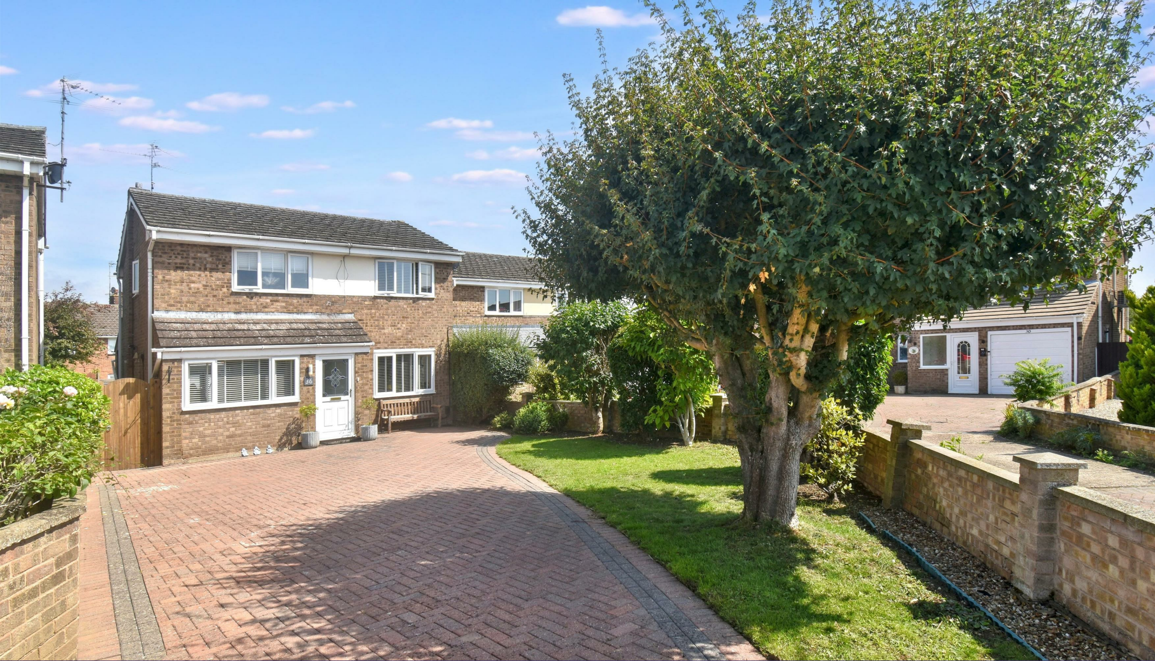
36 The Lawns Corby, NN18 0TA