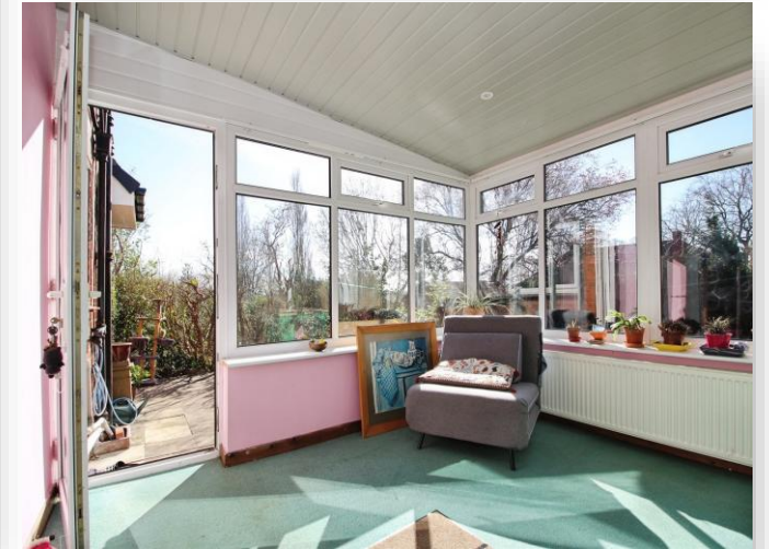
Queenswood Close, Leeds LS6 3LZ