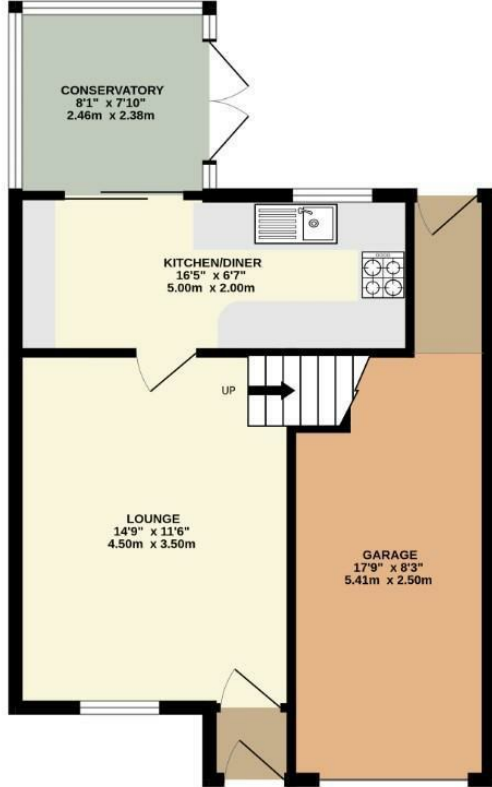
GROUND FLOOR 518 sq.ft. (48.1 sq.m.) approx.