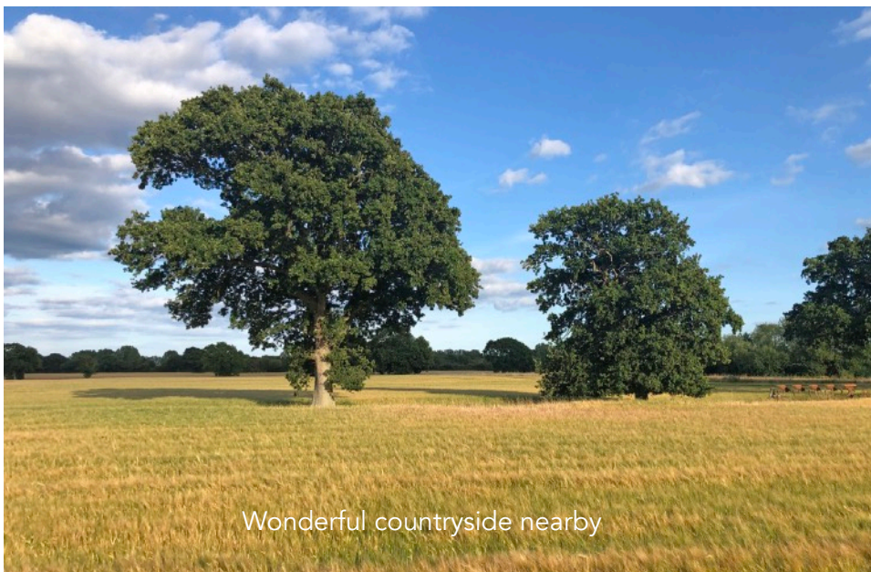
Wonderful countryside nearby