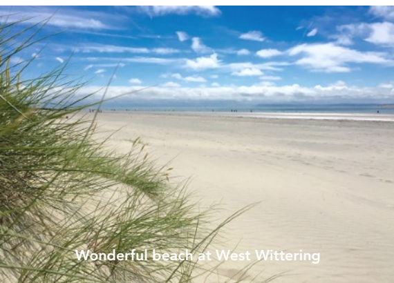
Wonderful beach at West Wittering