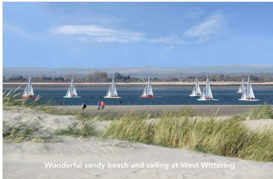
Wonderful sandy beach and sailing at West Wittering

A spectacular detached barn conversion of immense charm and character with 2 bedrooms, 3 bathrooms, 2 receptions, and superb a detached annexe with a bedroom, bathroom, kitchen/sitting room with own entrance, set in stunning landscaped gardens in all about 0.37 acres, located in a semi rural area of a most desirable village, situated between Sidlesham Quay and Chichester Marina