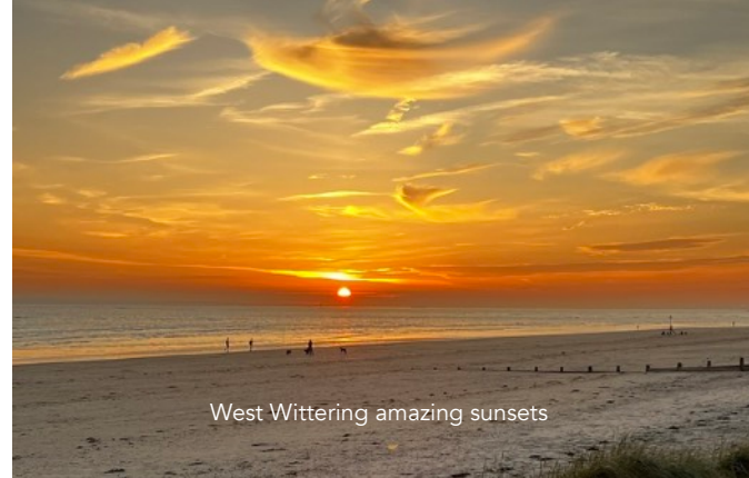
West Wittering amazing sunsets