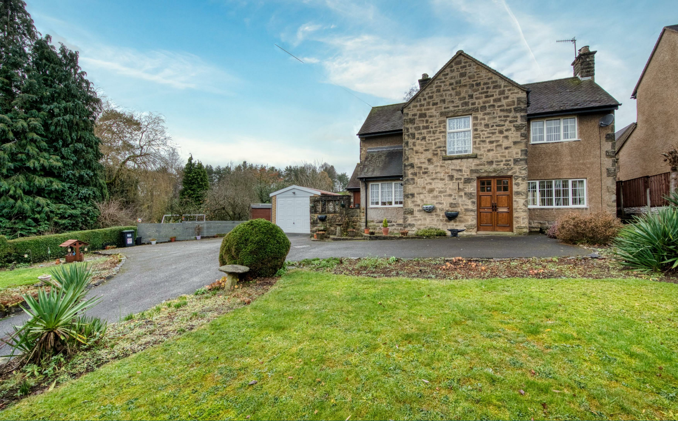
Cherry Tree House Baslow Road, Bakewell, Derbyshire, DE45 1AF