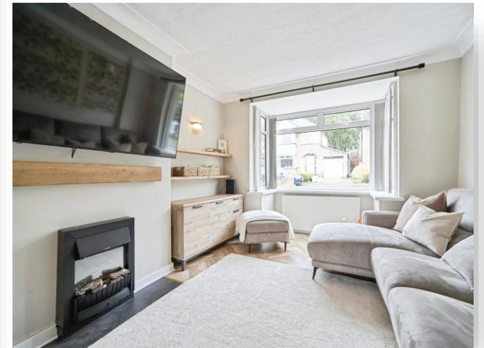
Woodside Avenue, Bingley BD16 1RB