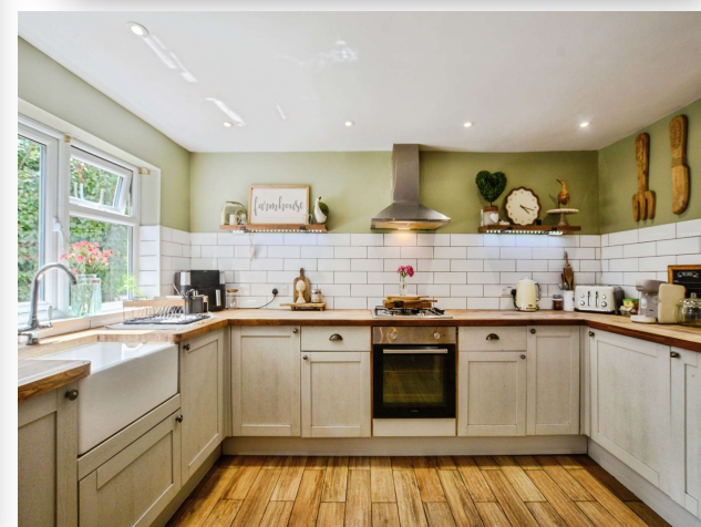
Primrose Cottage East End, Thorpe St. Peter Skegness PE24 4PQ