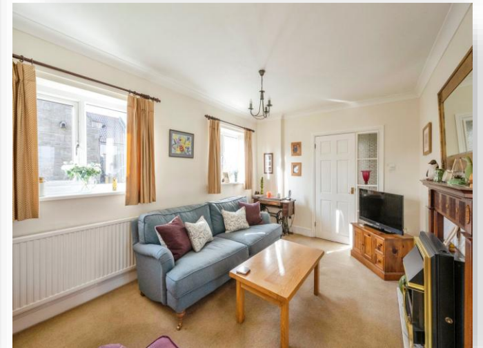
Tithe Barn Court Crow Tree Lane,Adwick-Upon-Dearne Mexborough S64 0NT