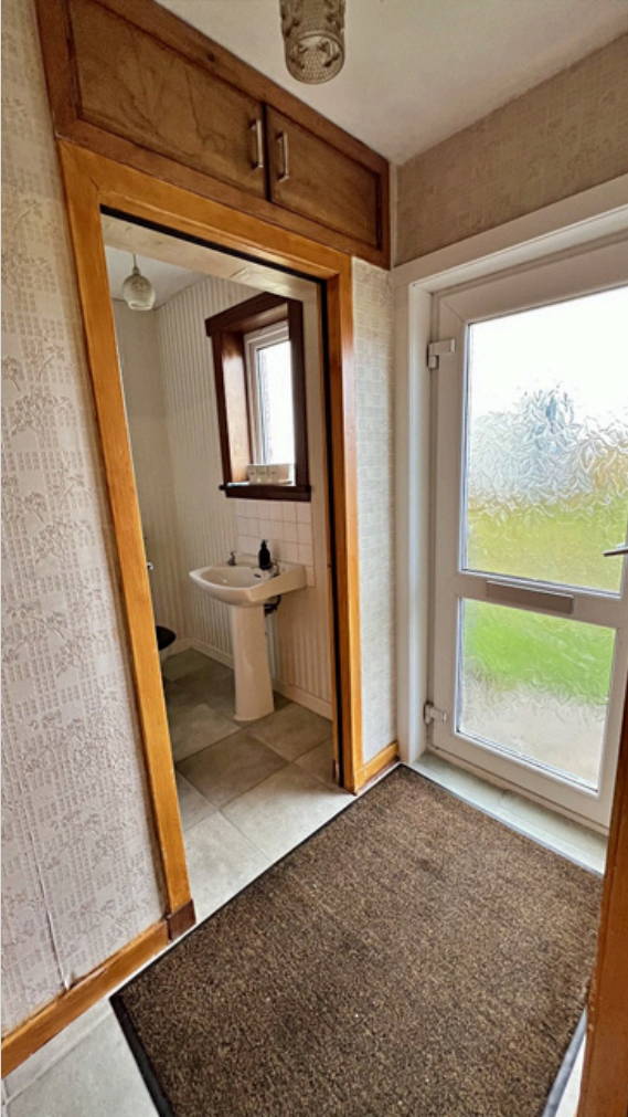
Porch - 0.98m x 1.91m