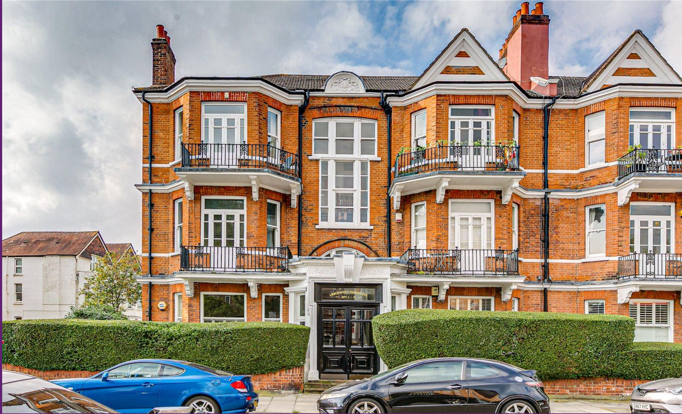
Linkenholt Mansions Stamford Brook Avenue, W6