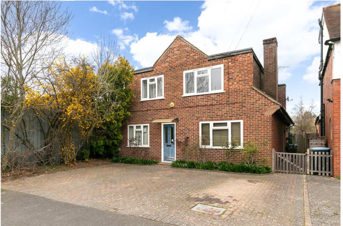
Flat 2 1 Garden Road Walton-On-Thames Surrey KT12 2HQ