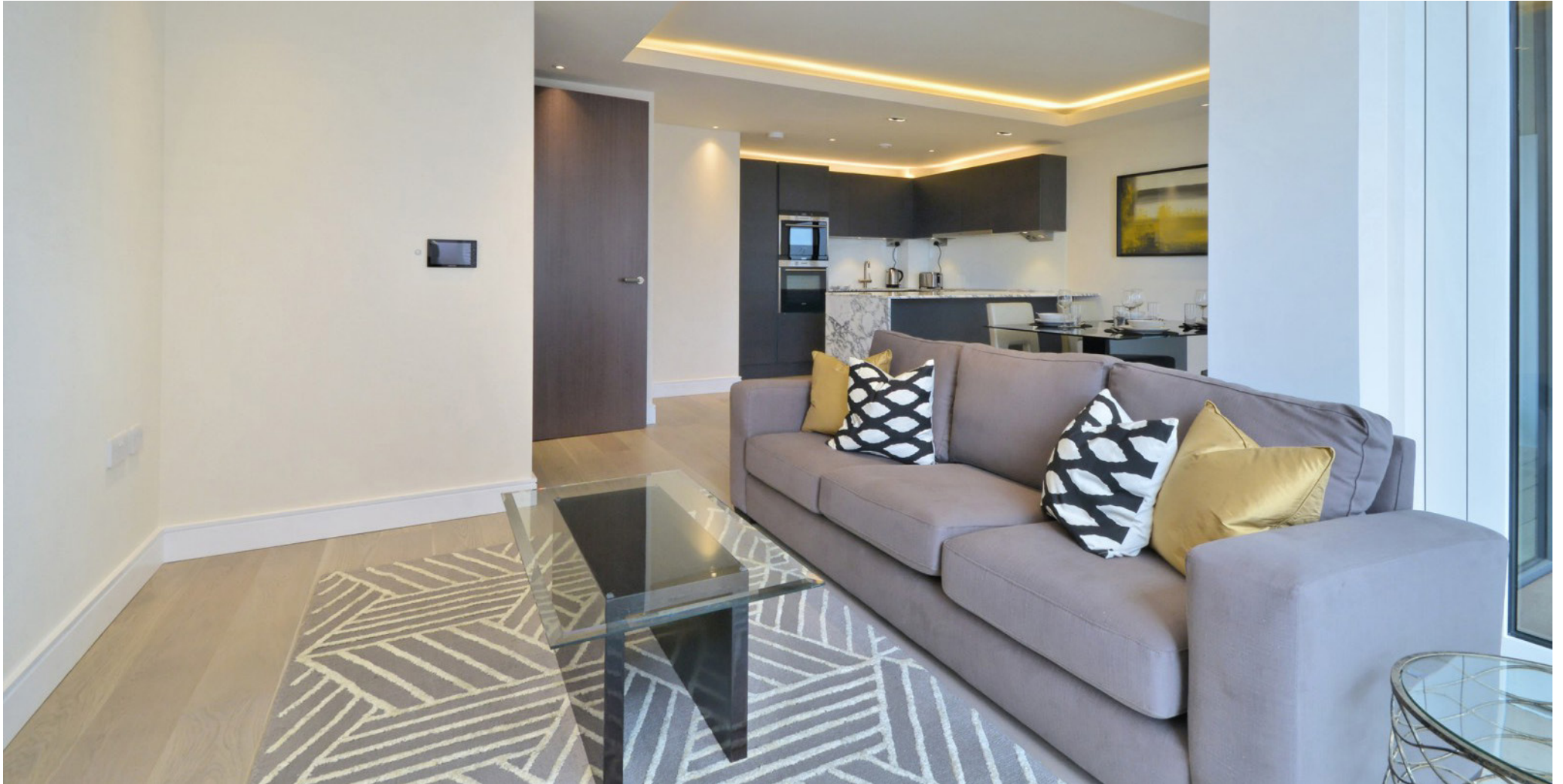
DOCKSIDE HOUSE, Fulham SW6