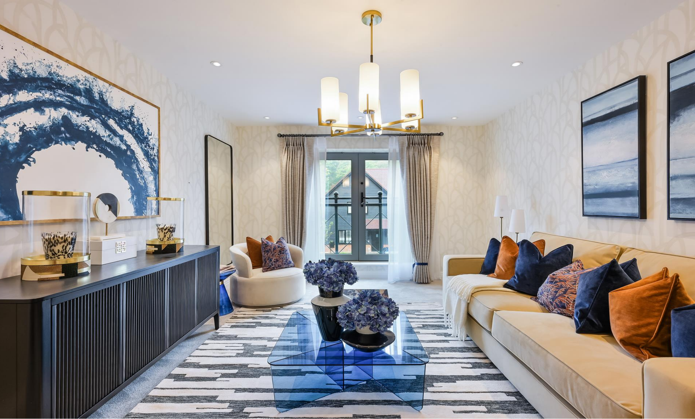
Skylarks, Rottingdean Brighton BN2 7AB