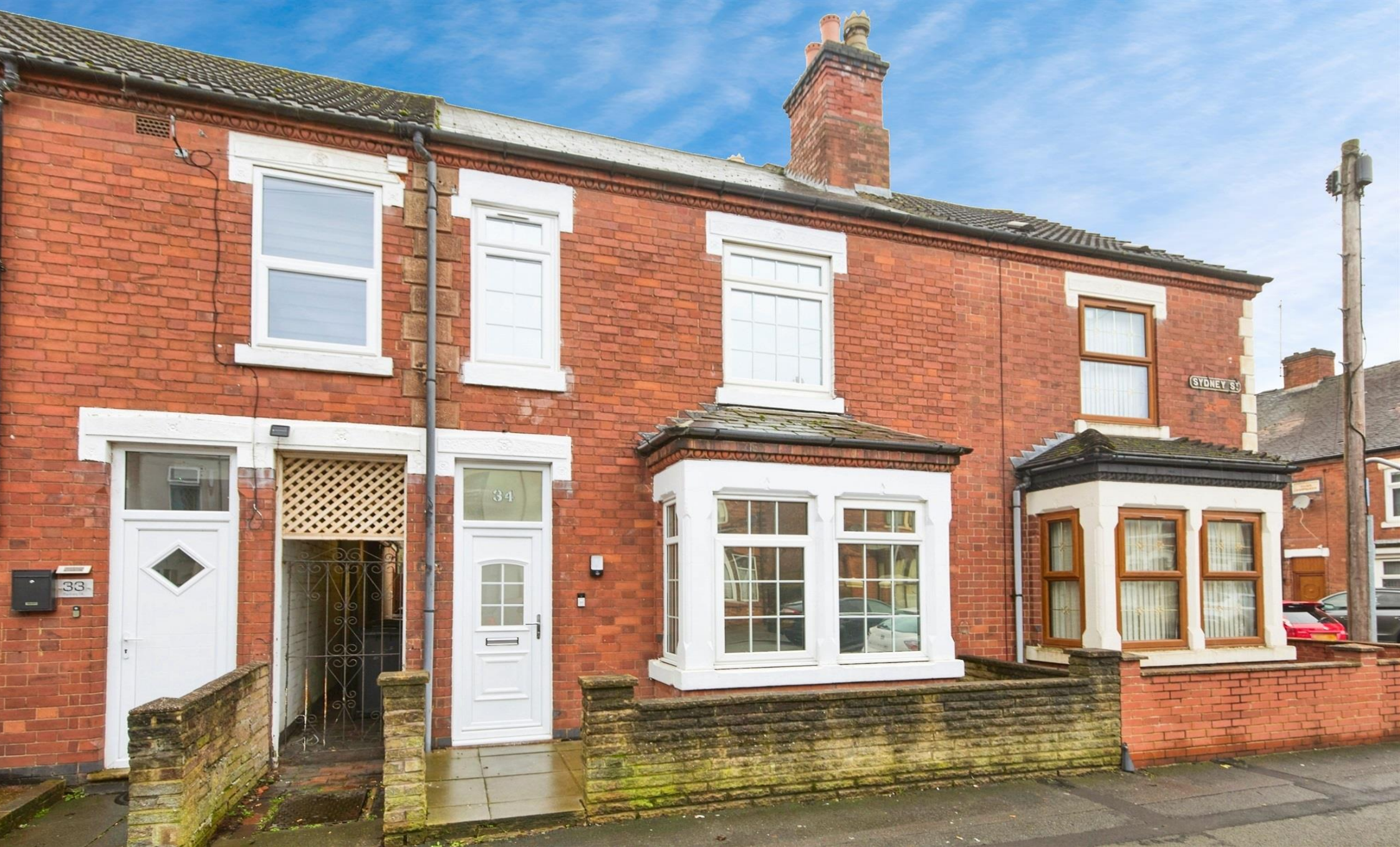
Sydney Street, Burton-On-Trent