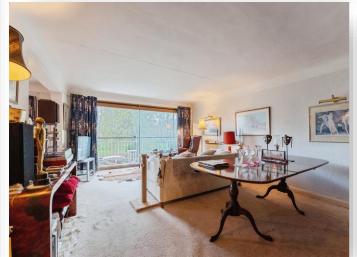
Vyner Court, Vyner Close, Bidston, Prenton, CH43 7XL