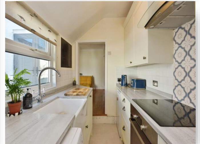
Queen Street, Stony Stratford Milton Keynes MK11 1EG