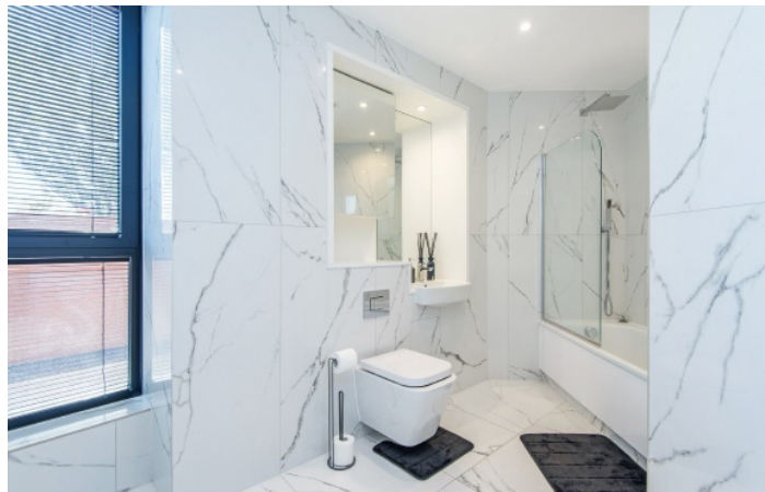
Leamouth Road, E14