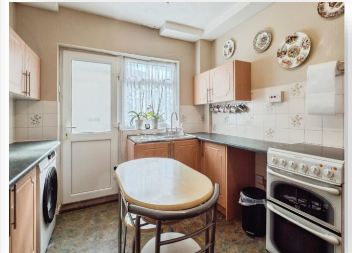
Briarfield Drive, Leicester LE5 1RG