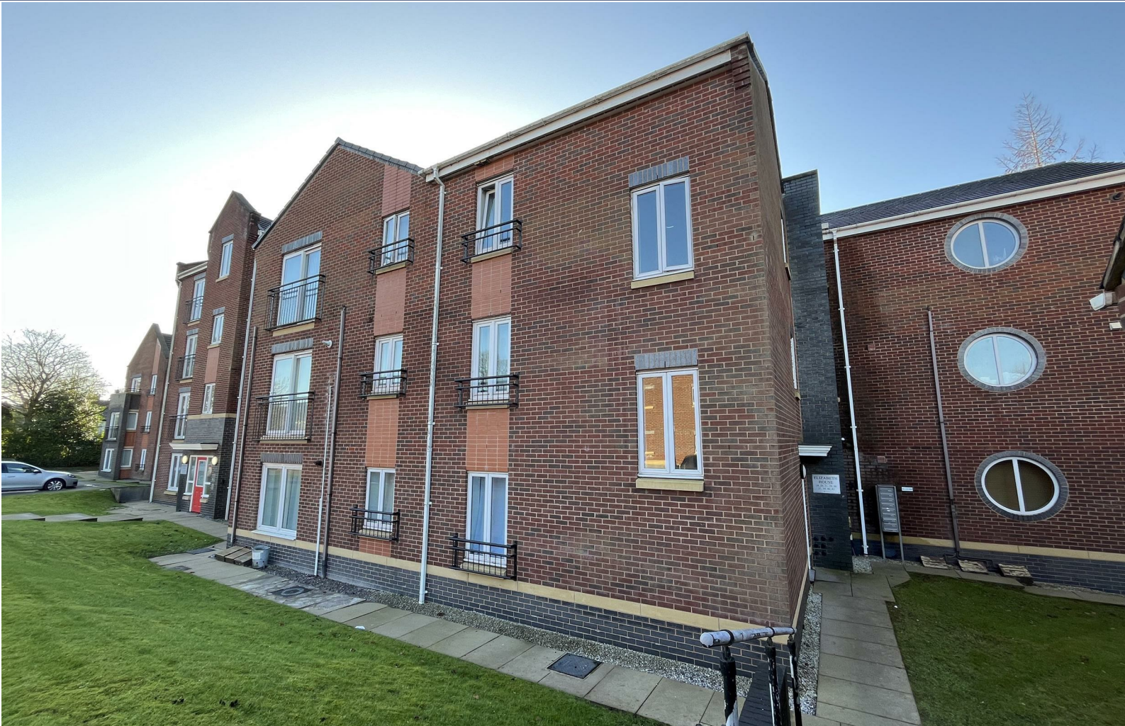
Scholars Court Hartshill