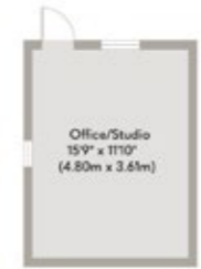
Outbuilding Approximate Floor Area 186 sq. ft (17.32 sq. m)

Whilst every attempt has been made to ensure the accuracy of the floor plan contained here, measurements of doors, windows, rooms and any other items are approximate and no responsibility is taken for any error, omission, or mis-statement. This plan is for illustrative purposes only and should be used as such by any prospective purchaser or tenant. The services, systems and appliances shown have not been tested and no guarantee as to their operability or efficiency can be given.