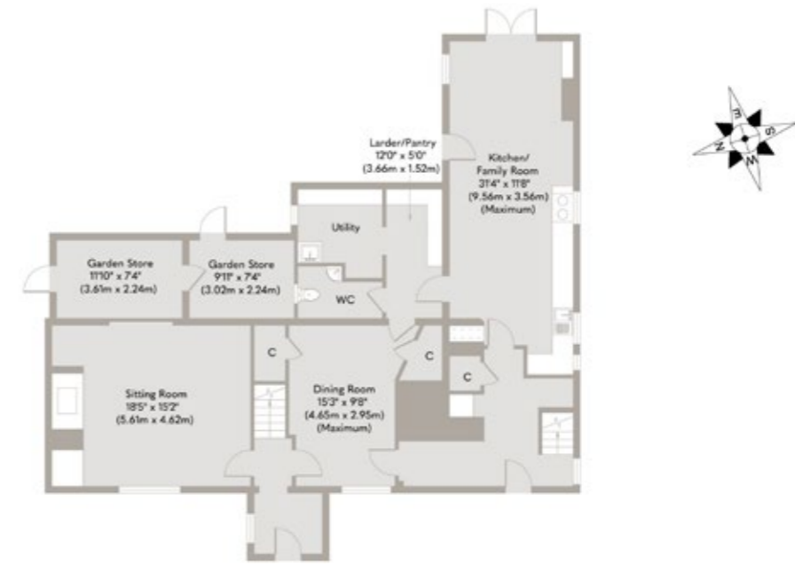
Ground Floor Approximate Floor Area 1462 sq. ft (135.85 sq. m)