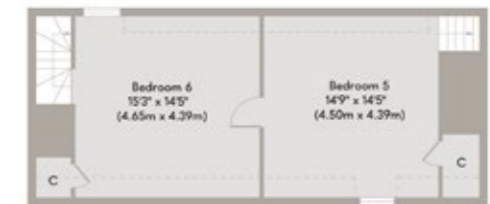
Second Floor Approximate Floor Area 563 sq. ft (52.29 sq. m)