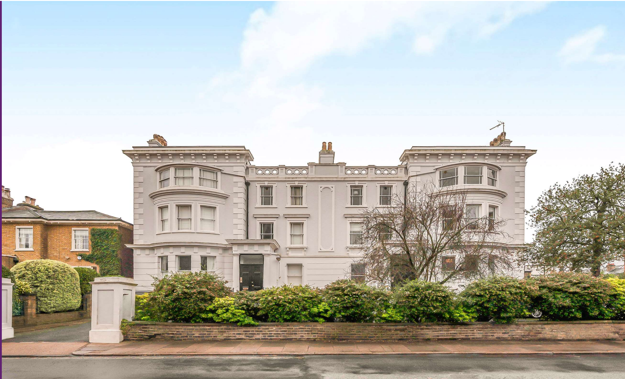
Burlington House Kings Road, TW10