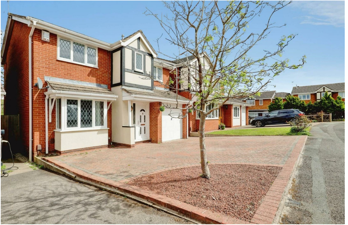
Royston Close, Coventry