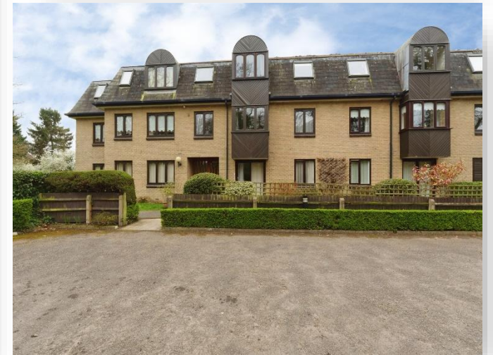
The Maltings, Brandon, IP27 0BL