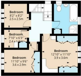
First Floor Floor Area 550 Sq Ft - 51.10 Sq M