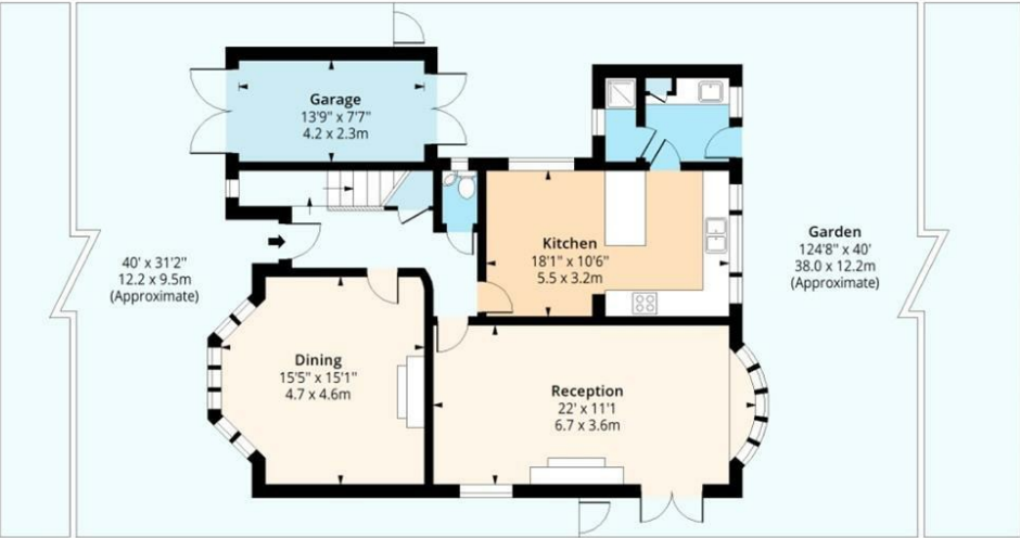
Ground Floor Floor Area 900 Sq Ft - 83.61 Sq M