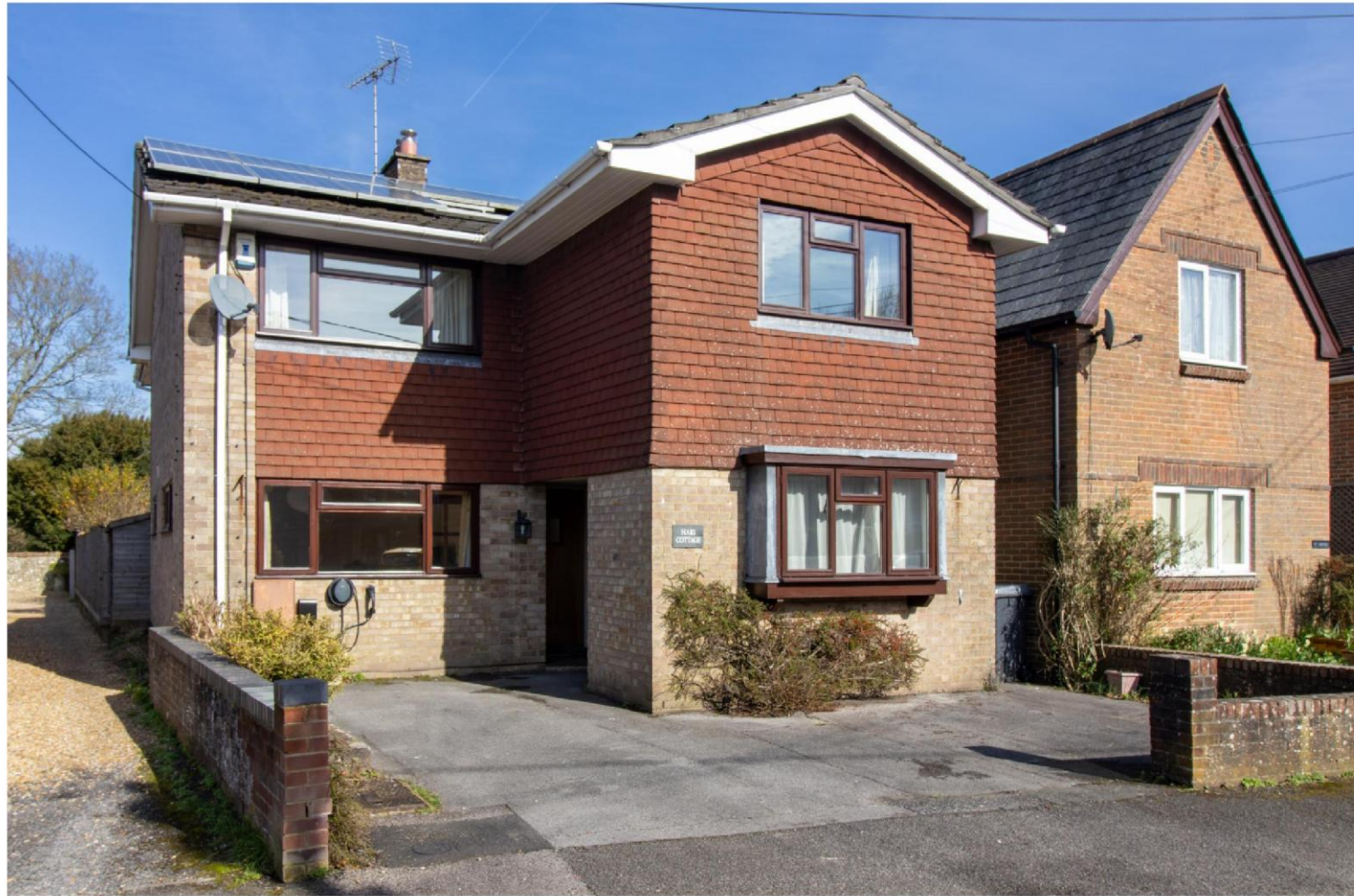
At home in Alresford