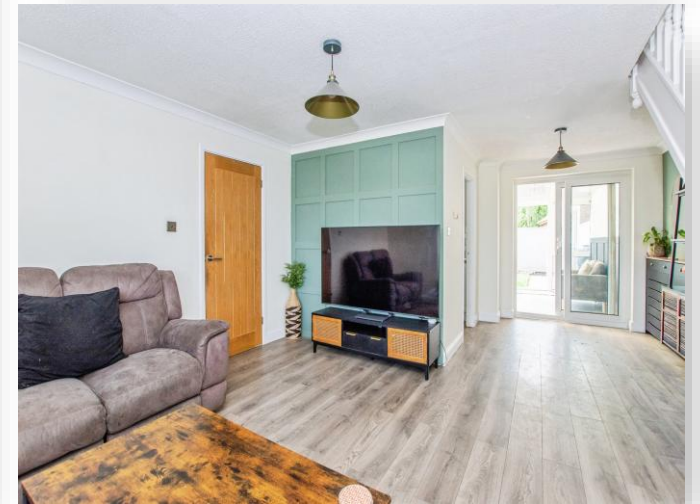
Heron Road, Wisbech PE13 2TR