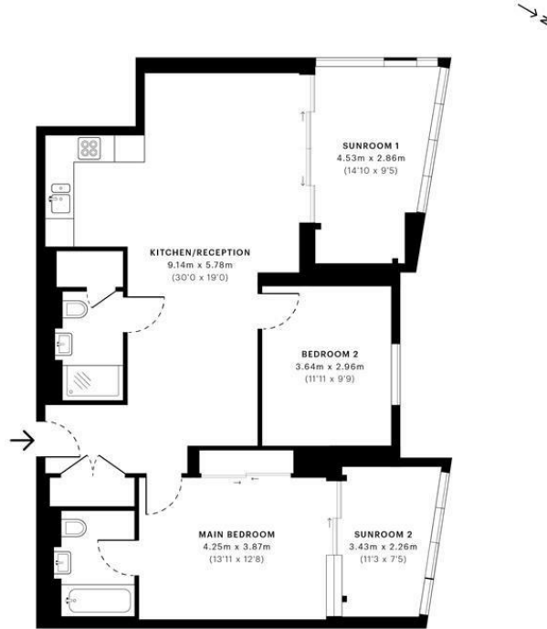
— Eleventh Floor

GROSS INTERNAL AREA (GIA) The footprint of the property 100.14 sqm / 1077.90 sqft