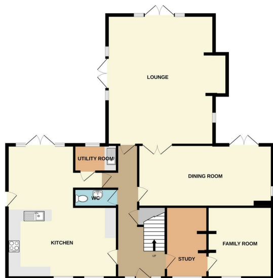
GROUND FLOOR 1409 sq.ft. (130.9 sq.m.) approx.