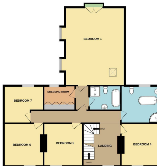
1ST FLOOR 1344 sq.ft. (124.8 sq.m.) approx.