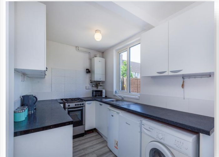
Mortimer Way, Leicester LE3 1GR