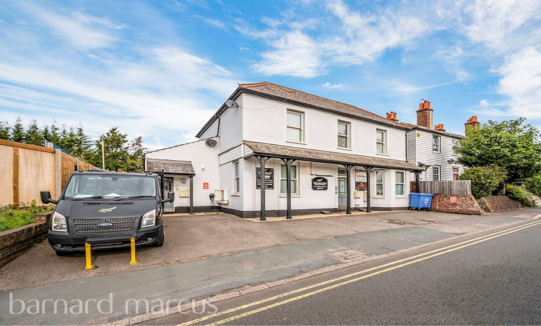
Stability House London Road, Ewell Epsom KT17 2BL