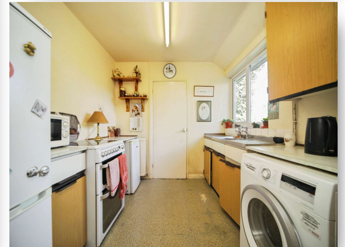
Middlewood Cottages, Offton, Ipswich, IP8 4RR