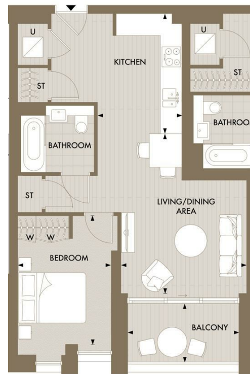
TYPE C1D 1 BEDROOM APARTMENT