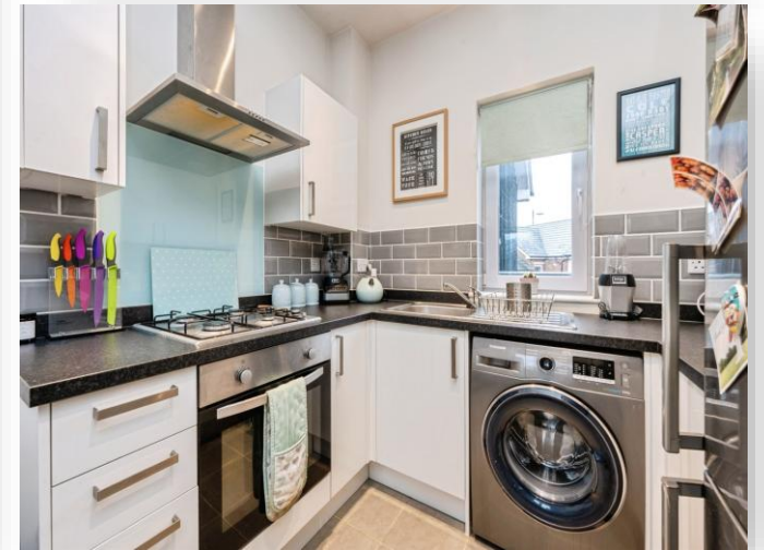
Bluebell Court, Leighton Road, Leighton Buzzard, LU7 1FZ