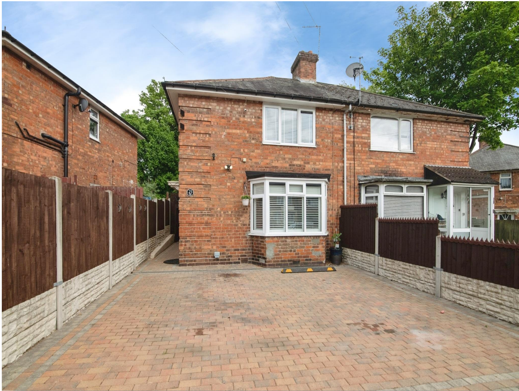
Bendall Road, Birmingham B44 0SP