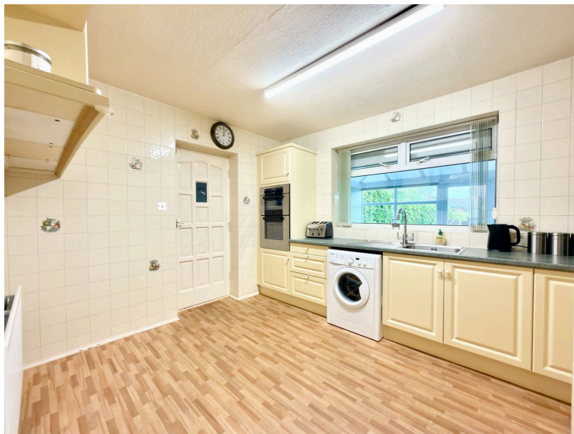
GROUND FLOOR 918 sq.ft. (85.2 sq.m.) approx.