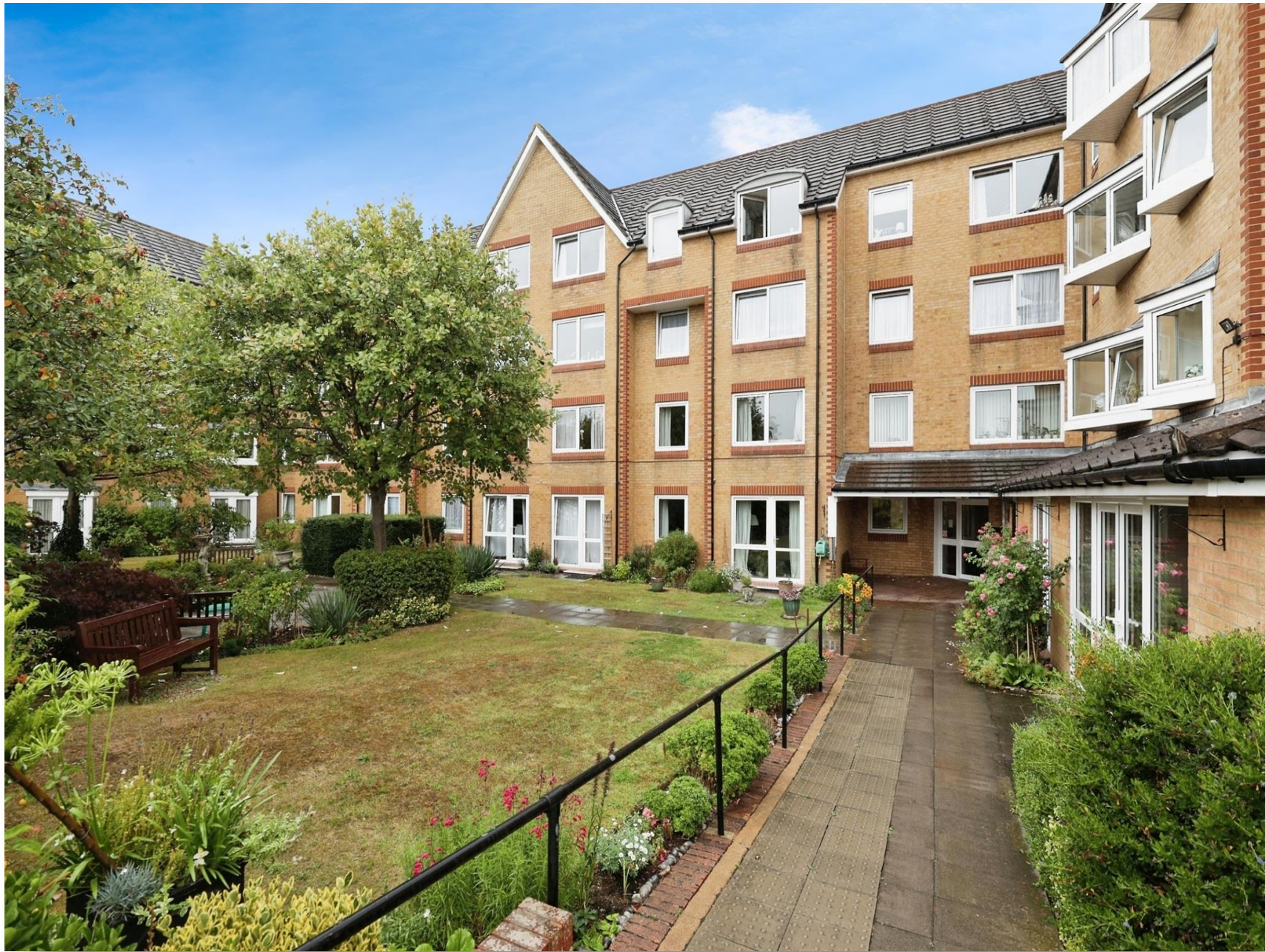
Homemanor House, Cassio Road, Watford, WD18 0QS