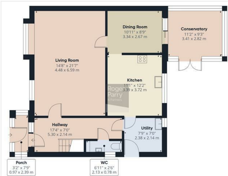
Ground floor Building 1